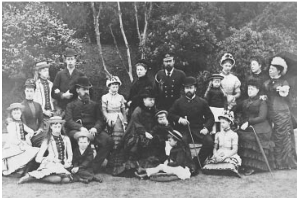
QUEEN VICTORIA AND HER FAMILY. Queen Victoria, who ruled Britain from 1837 to 1901, married Prince Albert of Saxe-Coburg and Gotha in 1840 and subsequently gave birth to four sons and five daughters, who married into a number of European royal families. Queen Victoria is seated at the center of this 1881 photograph, surrounded by members of her family.

London, whose slogan of “land and freedom” epitomized his belief that the Russian peasant must be the chief instrument for social reform. Herzen believed that the peasant village commune could serve as an independent, self-governing body that would form the basis of a new Russia. Russian students and intellectuals who followed Herzen’s ideas formed a movement called populism, whose aim was to create a new society through the revolutionary acts of the peasants. The peasants’ lack of interest in these revolutionary ideas, however, led some of the populists to resort to violent means to overthrow tsarist autocracy. One such group of radicals, known as the People’s Will, succeeded in assassinating Alexander II in 1881. His son and successor, Alexander III (1881–1894), turned against reform and returned to the traditional methods of repression.